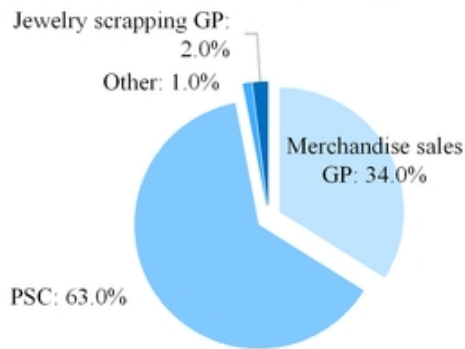
Fiscal 2017 Net Revenue by Product